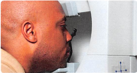
Visual field testing is used to monitor peripheral, or side, vision