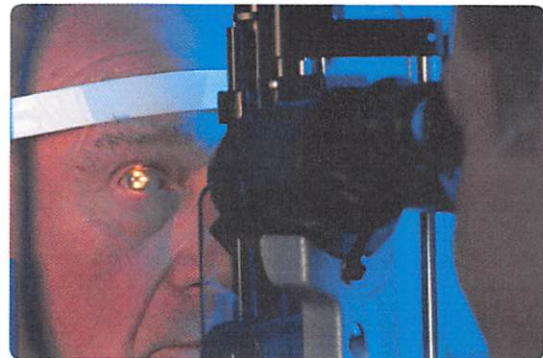
Regular eye exams with an ophthalmologist are important for maintaining good vision.

Tests may include certain types of scans of the body. Those scans can show how well blood is flowing through your carotid arteries. Your ophthalmologist might dilate (widen) your pupils and examine the back of your eye to check for blocked blood vessels.