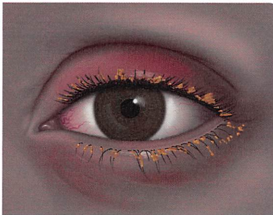
With some types of blepharitis, the eyelids become coated with oily particles and bacteria near the base of the eyelashes.

Blepharitis is when you have bacteria and oily flakes at the base of your eyelashes. Your eyelids are red, swollen, or feel like they are burning. Blepharitis is very common, especially among people who have oily skin, dandruff or dry eyes.