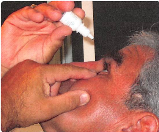
Artificial tears or steroid eye drops may help relieve redness, swelling or dry eye from blepharitis.

Antibiotics. Your ophthalmologist may have you use an antibiotic ointment on your eyes. Put a small amount of ointment on a clean fingertip or a cotton swab (Q-tip). Gently apply the ointment to the base of your eyelashes. Do this just before bedtime, or as your doctor recommends. Your doctor might also prescribe an antibiotic medicine for you to take by mouth.