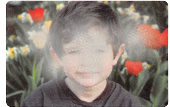
Blurry or dim vision