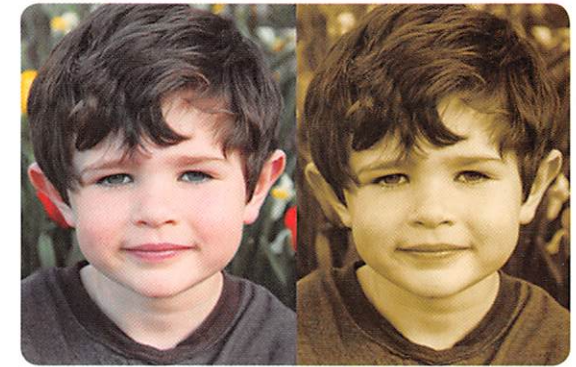
Left, normal vision. At right, dull or yellow vision.