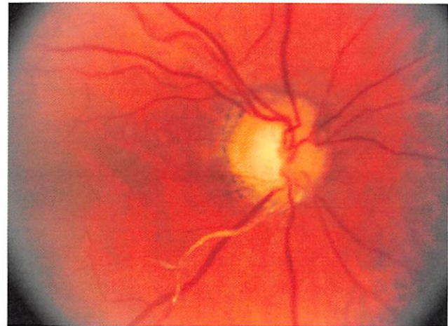
An image of a branch retinal artery occlusion.

If you have any of these symptoms, get medical help right away to help prevent vision loss.